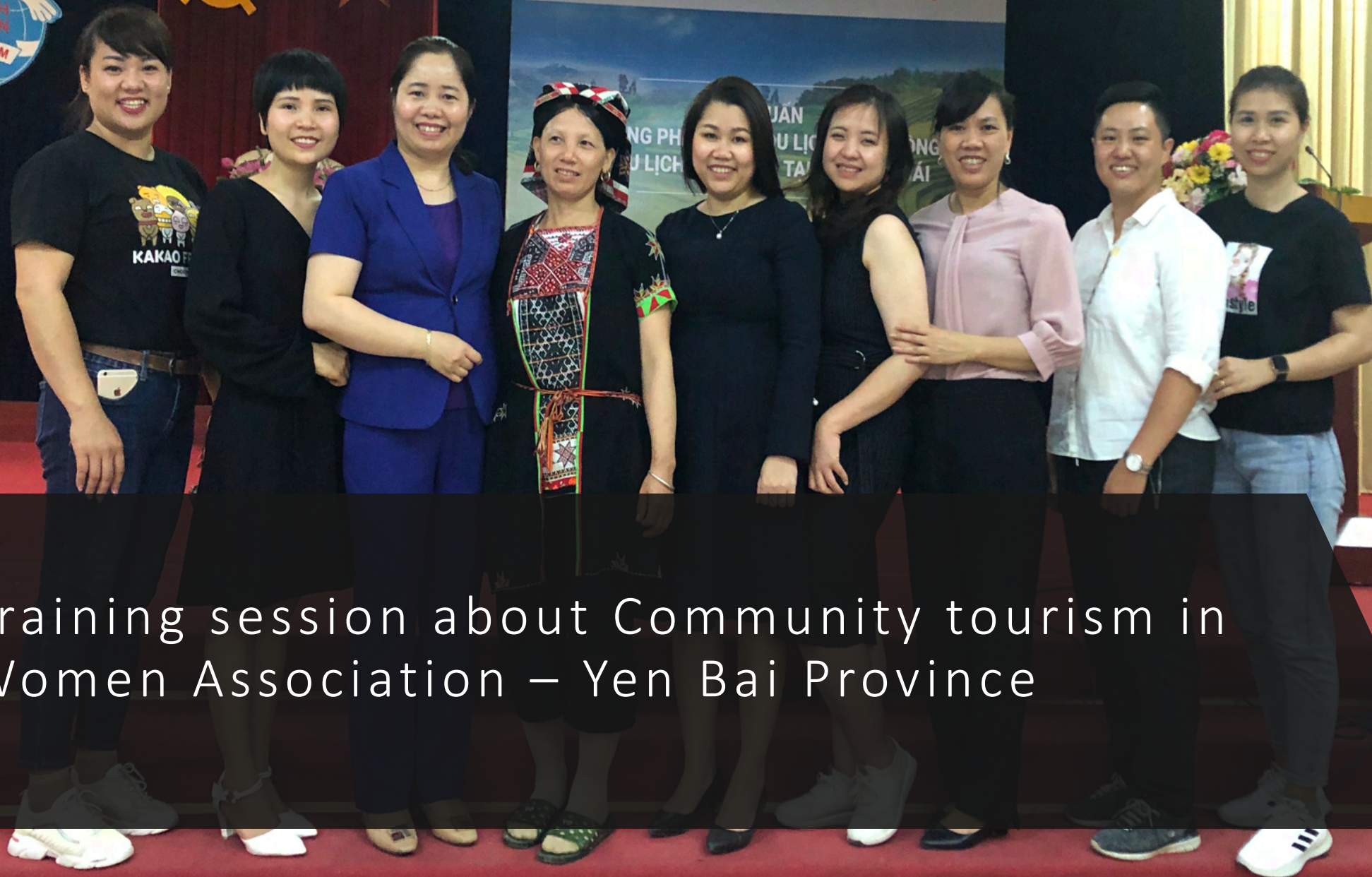
Training session about Community tourism in Women Association – Yen Bai Province