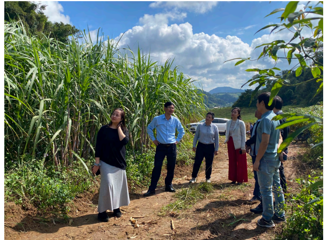
Tourism planning for Phieng Cam commune, Mai Son district, Son La province (Dec 2021-...)