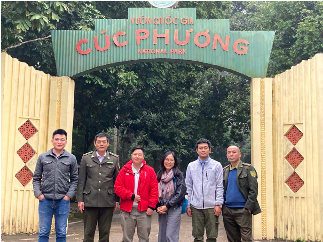
Community-based tourist product consulting for Cuc Phuong National Park (Jan 2022-Sep 2022)